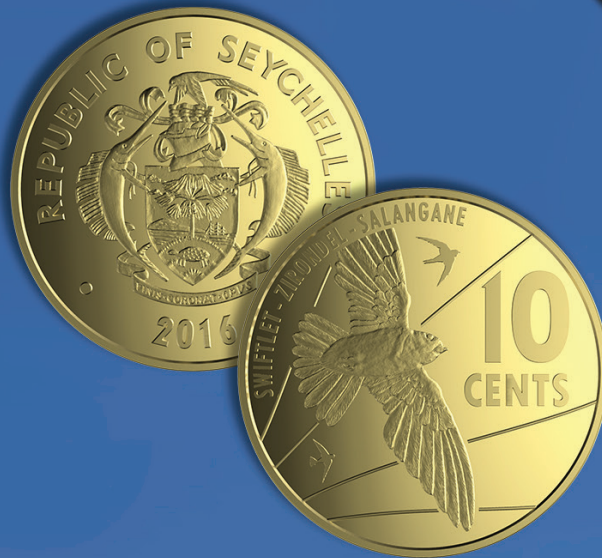
Endemic of Seychelles; Seychelles Swiftlet [Aerodramus elaphrus]

Visit www.cbs.sc to know more about the new banknotes and coins